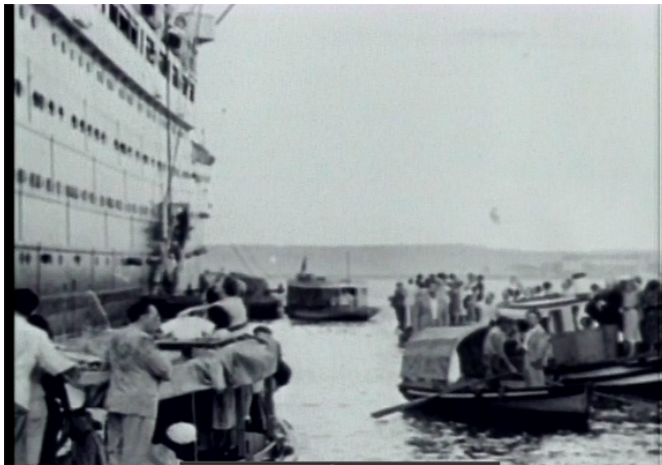
In Havana harbor unable to dock. Relatives in surrounding boats.

Several days before reaching Cuba, the ship’s captain received a message that foretold the problem: passengers might not be able to disembark in Cuba without paying for additional entry requirements. In early 1939 Cuba passed a decree that stated that each refugee needed a