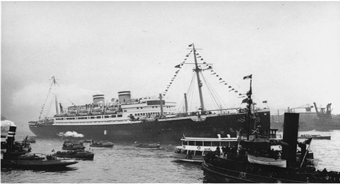
S.S. St. Louis surrounded by smaller vessels in the port of Havana