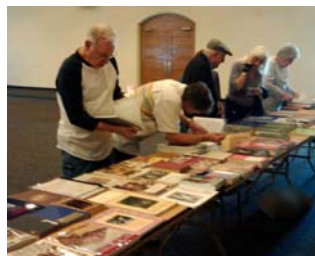
Perusing the Traveling Library